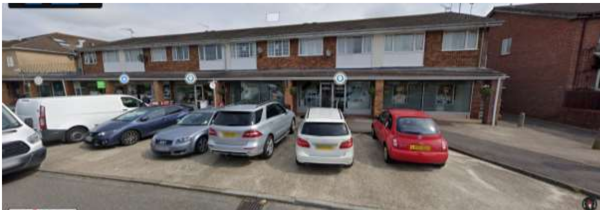
Main shopping parade